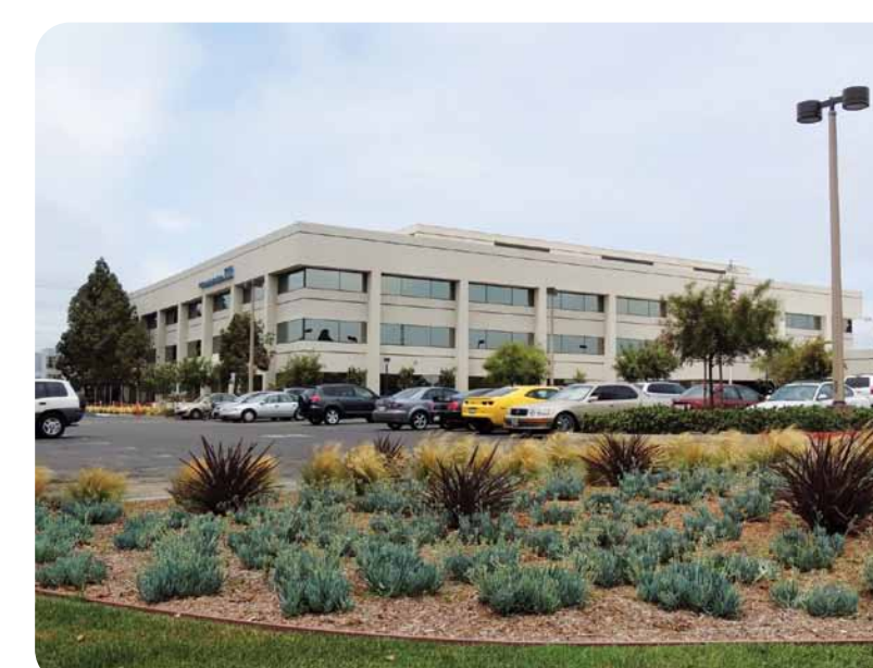
ECS Headquarters moves to National City