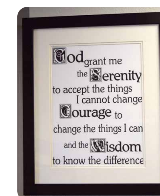
The Central East Regional Recovery Center opens