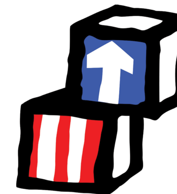
Head Start programs begin in South Bay