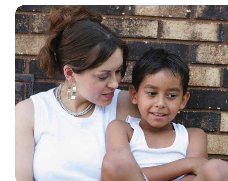
Para Las Familias begins services