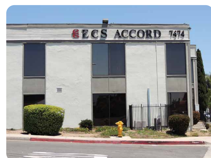
ACCORD DUI Program begins operation