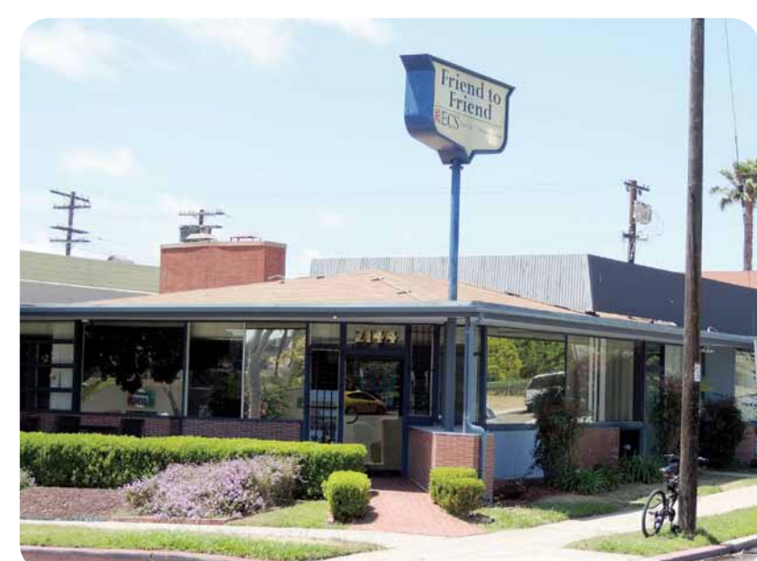
Friend to Friend clubhouse opens