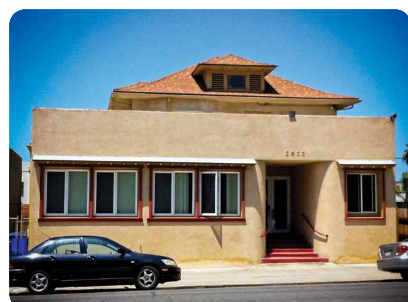
Uptown Safe Haven opens