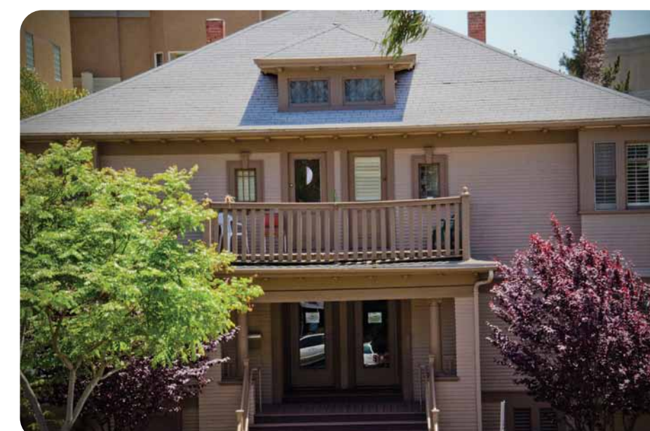
Downtown Safe Haven opens