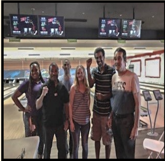
Bowling with Friends