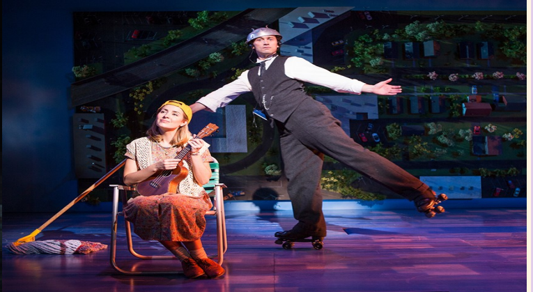
Members enjoyed an evening at the Old Globe Theater in Balboa Park